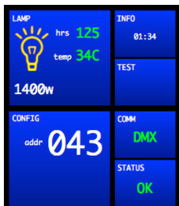
Sample Menu Screen

Bad Boy features a built-in LCD touchscreen display, which provides access to control, configuration, status, and testing functions.